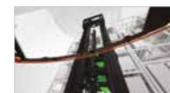
Angled overhead guard