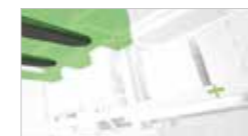
Fork position laser

The reach truck range is flexible: ideal for high-speed load transport indoor but also outdoor with the O-series. Replenishing low racking levels or storing goods at high heights happens fast thanks to the lifting and lowering speeds. The BT Reflex trucks offer class-leading residual capacities thanks to the superb stability of the truck.