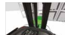
Strategically placed hoses