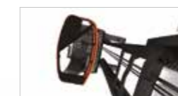
Transparent overhead guard